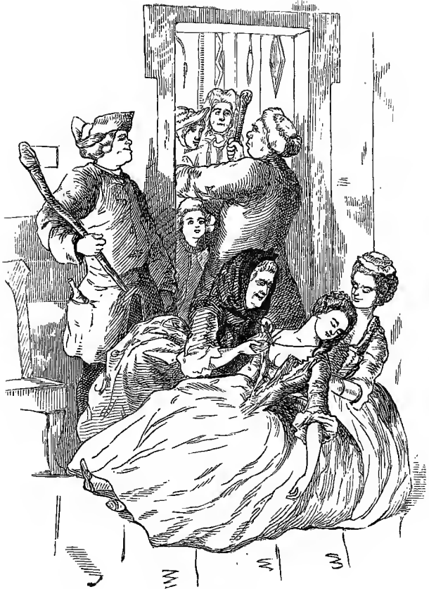
A Fainting Fit.